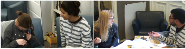
Figure 2: Pairs of friends conversing and observing Hint .

unfamiliar with skin conductance and those whose research involves skin conductance or other biosignals. To address all these aspects is beyond the scope of this short paper; here we focus on emotional interpretations.